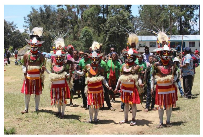
Figure 1: Sinsibai primary school student leaders welcoming researchers

Sinsibai (variously spelled 'Tsinsibai', Tsinsipai', or 'Tsinjibai'), is located in Upper – Nebilyer, in the Mt. Giluwe Rural Local Level Government (LLG) of the Tambul- Nebilyer District of Western Highlands Province. It is located around thirty (30) kilometres south-west of Mt. Hagen, about 50 minutes travel by road. According to the 2011 census, the Mt. Giluwe Rural LLG had a population of 40,578 people. The National Department of Health in a 2015 'Due Diligence Report' provided an approximate total population of 4,650 people in Sinsibai (National Department of Health, 2015).