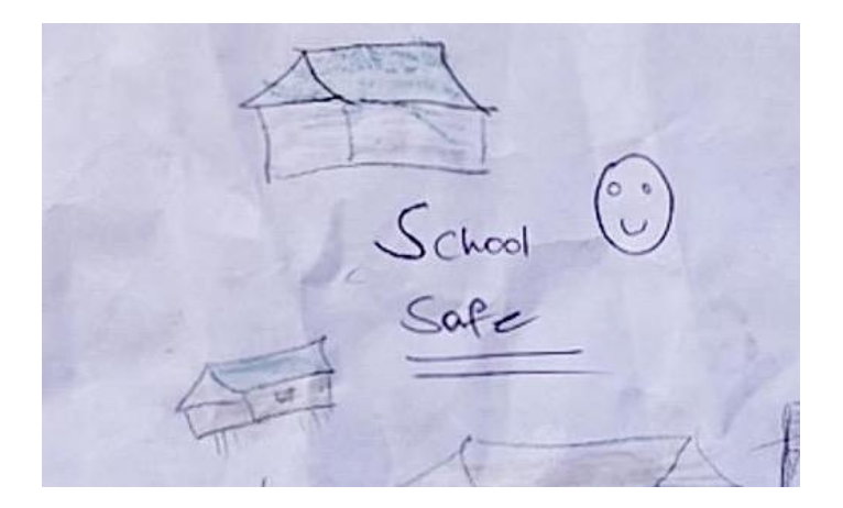
Table 1: List of 'unsafe' and 'safe' places identified by grade eight students