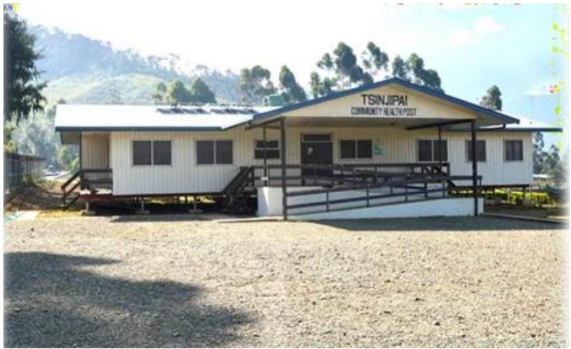
Figure 5: Sinsibai community health post

The health facility is a level two facility, which is referred to as a community health post, in PNG. Generally, it meets the required standard with proper infrastructure and staff houses. According to participants, there is inadequate staffing, as there are only three staff members now. Additionally, female participants who are mothers indicated that the community health post does not have the proper equipment to aid in supervised deliveries or to assist mothers at the early stages of pregnancy. Consequently, most expecting mothers are referred to Hagen General Hospital in Hagen town.