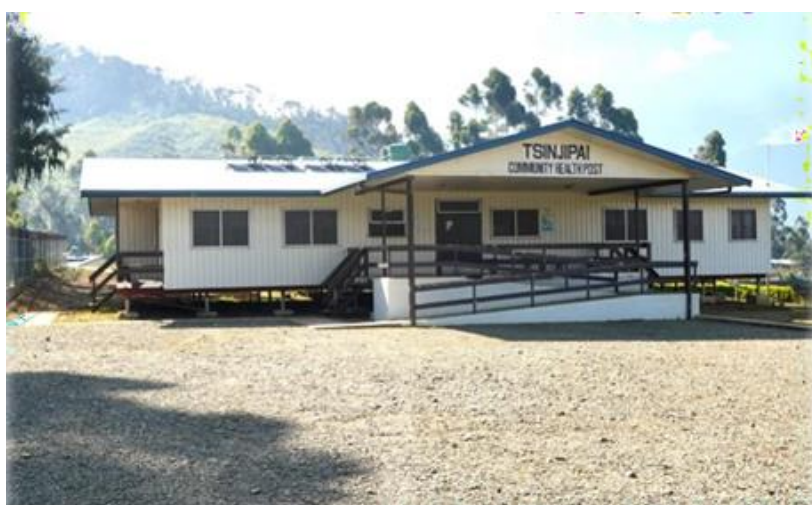
Figure 5: Sinsibai community health post

The health facility is a level two facility, which is referred to as a community health post, in PNG. Generally, it meets the required standard with proper infrastructure and staff houses. According to participants, there is inadequate staffing, as there are only three staff members now. Additionally, female participants who are mothers indicated that the community health post does not have the proper equipment to aid in supervised deliveries or to assist mothers at the early stages of pregnancy. Consequently, most expecting mothers are referred to Hagen General Hospital in Hagen town.