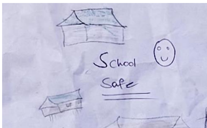
Table 1: List of ‘unsafe’ and ‘safe’ places identified by grade eight students