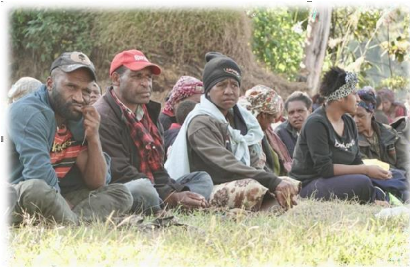
Figure 4: Community event that required cooperation of both young and old – witnessed by researchers

When young girls wear trousers, older women sit in groups and talk about it. But we young people think that we are living in a modern world. The community has changed, the world has changed. We are seeing new things from the outside world. So we think that with these changes, we can wear trousers and do what we want, but in the eyes of the older people, it is not good. That is why they talk (Adult Female FGD)