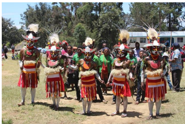
Figure 1: Sinsibai primary school student leaders welcoming researchers

Sinsibai (variously spelled ‘Tsinsibai’, Tsinsipai’, or ‘Tsinjibai’), is located in Upper – Nebilyer, in the Mt. Giluwe Rural Local Level Government (LLG) of the Tambul- Nebilyer District of Western Highlands Province. It is located around thirty (30) kilometres south-west of Mt. Hagen, about 50 minutes travel by road. According to the 2011 census, the Mt. Giluwe Rural LLG had a population of 40,578 people. The National Department of Health in a 2015 ‘Due Diligence Report’ provided an approximate total population of 4,650 people in Sinsibai (National Department of Health, 2015).