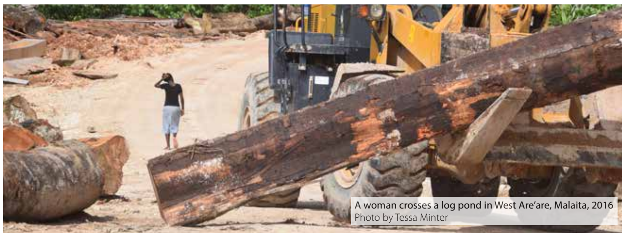
A woman crosses a log pond in West Are'are, Malaita, 2016