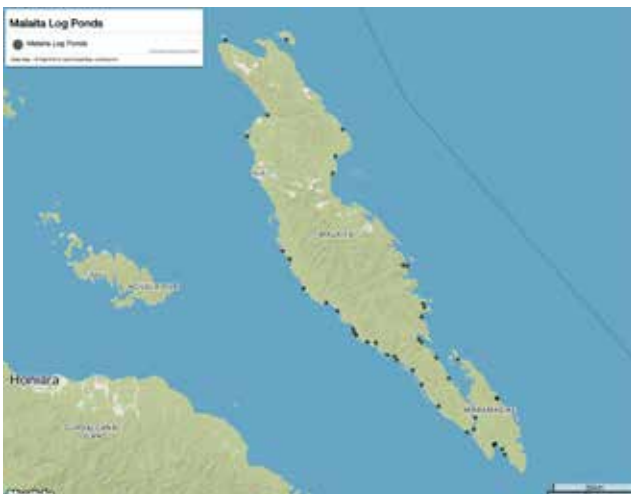
Figure 1. Distribution of log ponds on Malaita, 2019.

While this alarming situation affects both women and men, women and girls experience specific and far-reaching negative impacts owing to their marginalization in ownership and decision making regarding land and natural