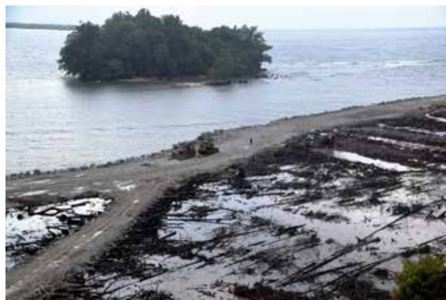
Figure 3. Mangroves, women's foremost fishing ground, are being cut down to create a log pond in East Malaita, 2017.

4. Loss of women's fishing grounds. The currently unsustainable logging practices severely impact fisheries, which is a core component of the rural subsistence economy. Mangroves are women's main fishing grounds, and are particularly important for gathering shells. However, mangroves near logging operations are damaged by sedimentation and oil pollution as a result of upstream logging activities. Crucially, log ponds are often constructed by clearing mangroves (Figure 3), resulting in a definitive loss of women's fishing grounds.