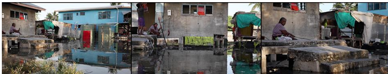
Figure 3. Angela Tiatia, Tuvalu , 2016. Three-channel, high-definition video with sound, 20:32 minutes. Courtesy of the artist and Sullivan+Strumpf, Sydney | Singapore