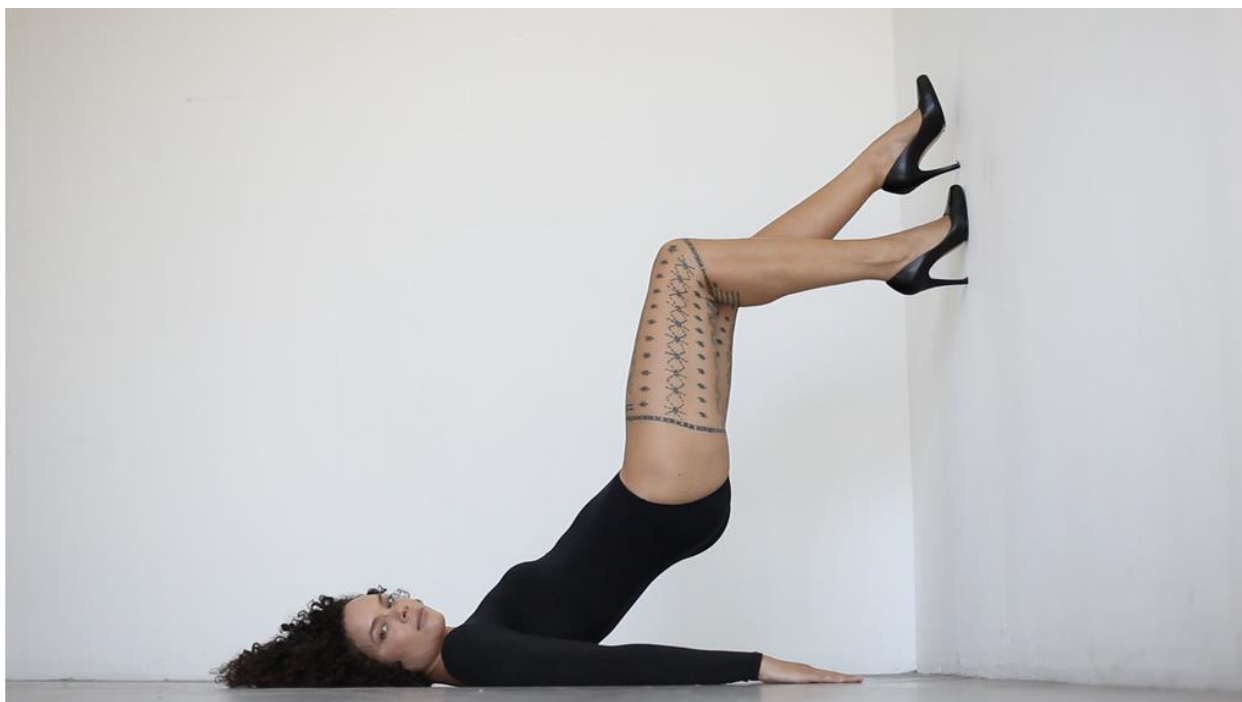
Figure 5. Angela Tiatia, Walking the Wall , 2014. Single-channel, high-definition video with sound, 13:04 minutes. Courtesy of the artist and Sullivan+Strumpf, Sydney | Singapore