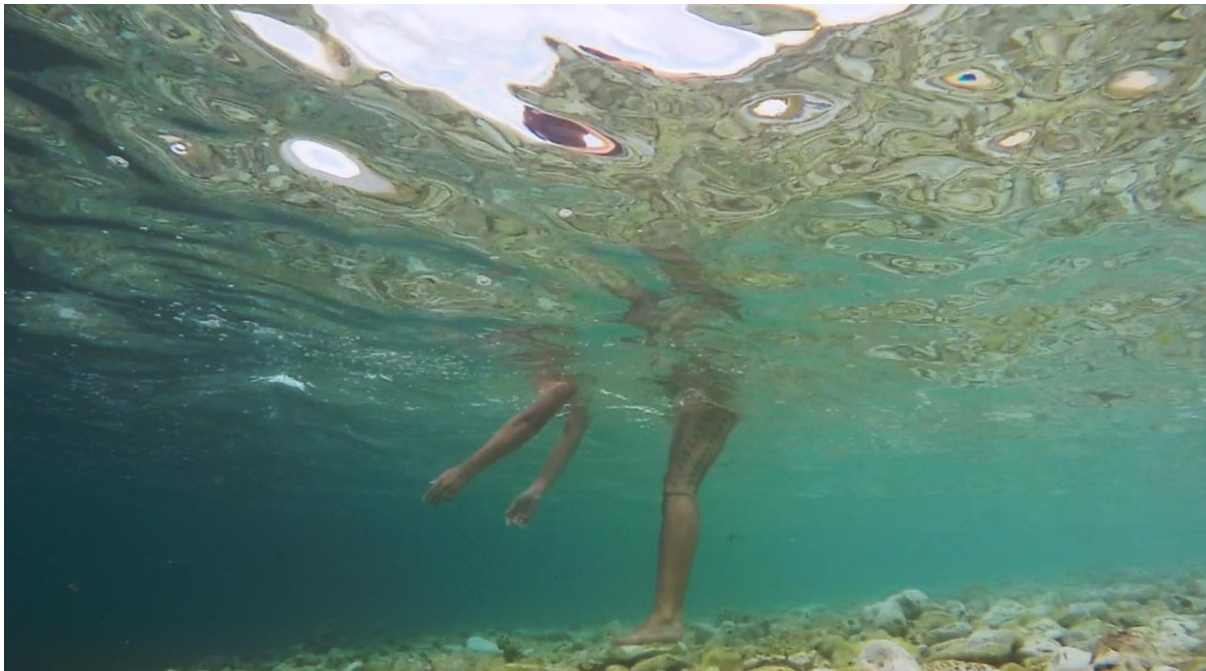
Figure 1. Angela Tiatia, Lick , 2015. Single-channel, high-definition video with sound, 6:33 minutes.

Keywords: contemporary Pacific art, Angela Tiatia, climate change, decolonial theory, environmental performance, survivance, Indigenous feminist Pacific