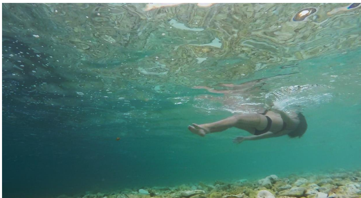
Figure 7. Angela Tiatia, Lick , 2015. Single-channel, high-definition video with sound, 6:33 minutes. Courtesy of the artist and Sullivan+Strumpf, Sydney | Singapore

There is an affinity between Rise and Lick in the ways the artists conceive of water as a force that supports islander resistance to neo-liberal narratives of Pacific Islander vulnerability. Both build on the visual language of the 350.org Pacific Climate Warriors by representing themselves literally immersed in the ocean as a way to strategically claim self-determination and autonomy in climate change discourse. 45 In Rise , Jetñil-Kijiner repurposes the language of sea level rise, calling for human-ocean solidarity through her refrain “we will rise.” 46 Likewise, Tiatia’s looped video performance of Lick ends as Tiatia allows an oncoming wave to pick her up and carry her out of the frame and towards the shore (Fig. 7). Rising with the water is emphasized in both video performances as a gesture to be repeated so that it can become embodied habitude and an emotional orientation from which to draw strength.