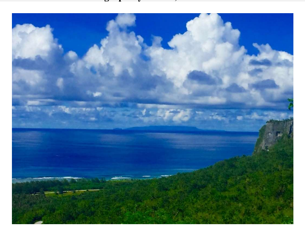
<u>Figure 2</u>: Cliffs to the right indicate where the range will be located, with live-fire ammunition falling on the forest, beach, reef, and sea. The neighbouring island of Luta (Rota) visible to the north.

Unfortunately, the feminist celebration of the first locally elected Maga'håga and female legislative supermajority was undermined by the imperial limitations of true political power due to continuing colonial US Congressional control. While this feminist political progress should be celebrated, US citizens from Guåhan are still denied the vote for US President and lack Congressional voting power and Senate representation. Moreover, although famalåo'an are well represented within the Liheslaturan Guåhan (Guam Legislature), they are unable to act in the interests of their constituents to protect important Indigenous sites from the DoD. Despite the advancement of electing the first Maga'håga and "Ladies-slature," political power over the island remains with the DoD over the locally democratically elected governor and legislature (Marchesseault, 2018). Famalåo'an continue to navigate the imposed US electoral systems and use the local political system strategically to elect famalåo'an. As first members of the community and organised through women-led groups, famalåo'an intentionally incorporated themselves into the imperial feminism framework to use their senatorial positions for environmental advocacy.