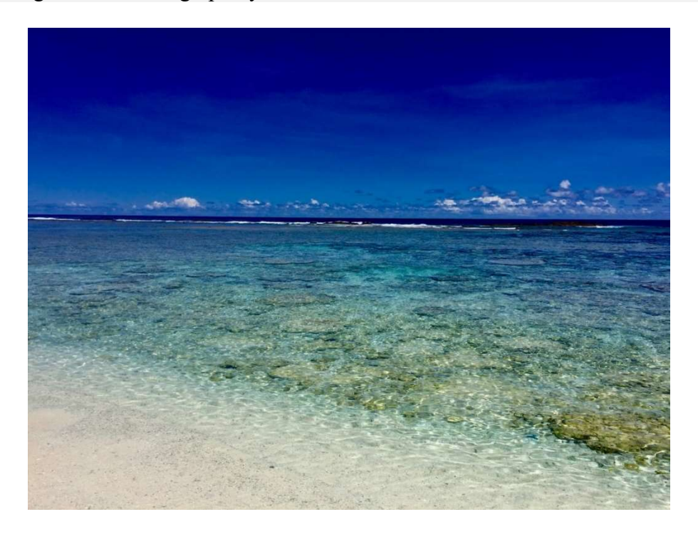
From Guåhan: Weaving an island-centric and gendered analysis

This work is founded upon the academic and intellectual mat that famalåo'an (women) scholars have woven as they have worked over generations toward Oceanic decolonisation and demilitarisation (Dé Ishtar, 1994; Teaiwa & Slatter, 2013; Na'puti & Rohrer, 2017). Teresia Teaiwa's decolonial and poetic approach to gender and (de)militarisation offers island-centric and Oceanic understandings of women's multifaceted forms of power (1992, 2008, 2011). Through scholarship and via Skype, she educated me on how to reflect on my white identity as