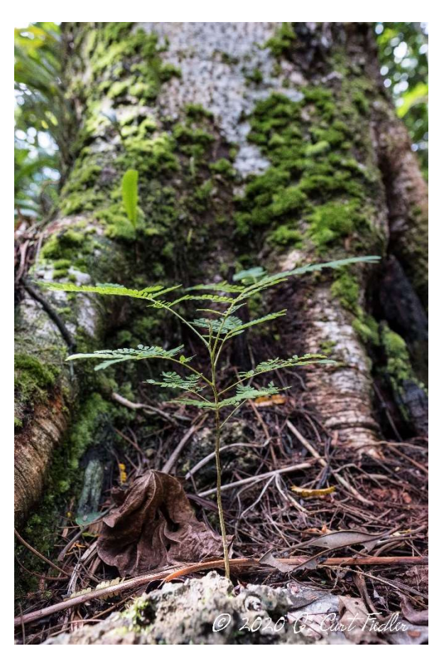
<u>Figure 5</u>: A seedling at the foot of the last seed-producing endemic hayun lagu ( Serianthes nelsonii Merr ) represents the next generation. This tree is locally referred to as the "mother tree" on Guahan.

Famalåo'an Guåhan resist within imposed political systems and imperial feminist frameworks and through women-led environmental advocacy, such as via the community organisation Prutehi Litekyan. Famalåo'an remain grounded through matriarchal lineages and identities as taotao tåno' (people of the land). They serve as guardians and defenders of their freshwater source and the endangered håyun lågu tree, demand the return of their ancestral tåno' y tasi and protect cultural heritage sites. While this article focuses on the specific CHamoru connection to i tåno' at Litekyan, the situation today is part of a long, matriarchal legacy of famalåo'an Guåhan resisting various empires.