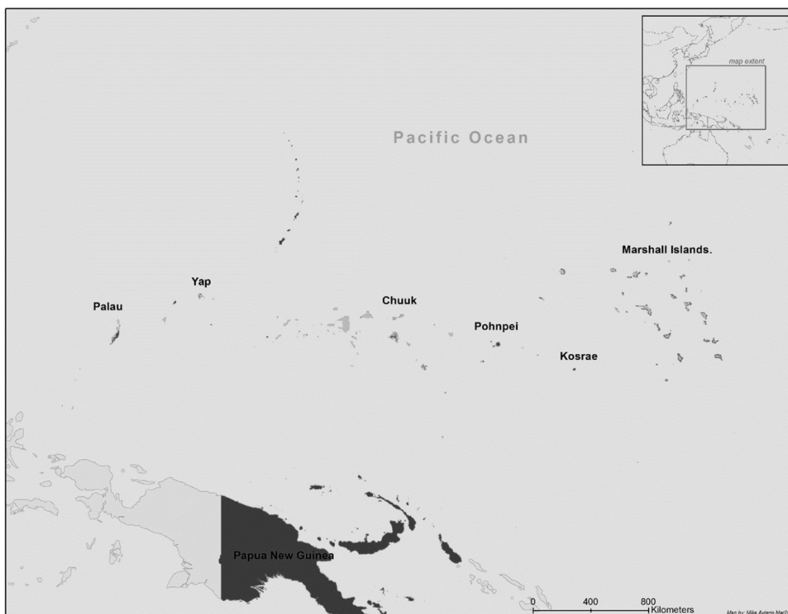
Fig. 1. Map of Pacific Island nations represented in the Women's Workshop in Palau, 2017.

Women were selected using non-probability sampling techniques, including purposive sampling and snowball sampling [29,64]. The Micronesia Conservation Trust and Nature Conservancy staff from Micronesia and Melanesia identified women who are leading conservation, development, and climate adaptation efforts in their communities. These local leaders were then asked to identify women in their communities based on selection criteria. Participants were selected to ensure geographic representation and differences in ethnicity (e.g., Marshallese, Palauan, Yapese, Kosraeans, Chuukese, Pohnpeians, Manus, etc.), socioeconomic status (landowners and non-land owners), education (ranging from no high school education to college graduates) and age (early 20s to mid-70s). Participants included subsistence farmers, participants of local women's groups, farming associations, and government, traditional and community leaders, and staff of local conservation and development NGOs, including those leading climate adaptation activities.