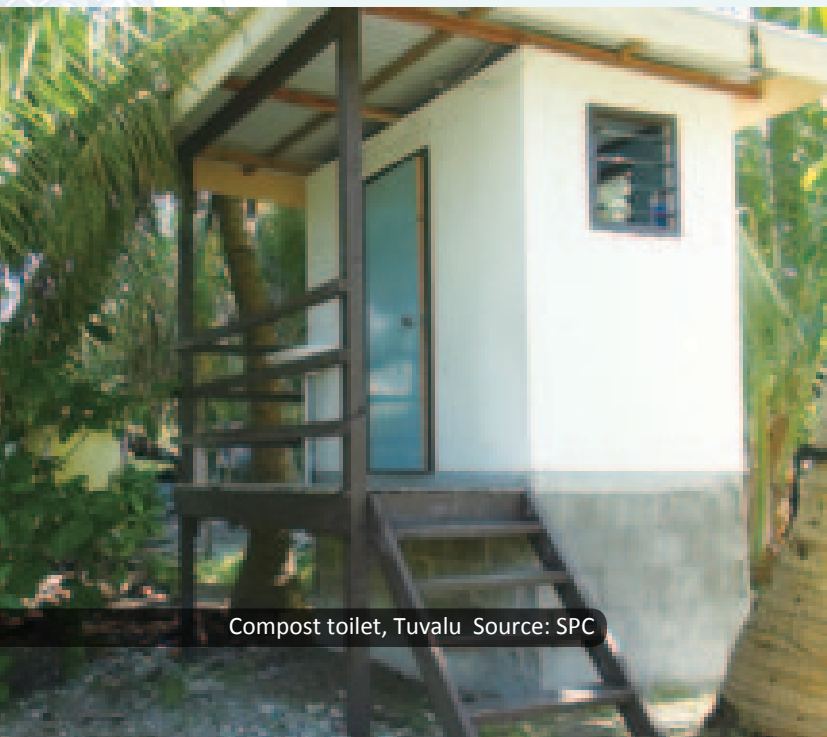
Compost toilet, Tuvalu

Integrated Water Resource Management (IWRM) project staff, Secretariat of the Pacific Community (SPC)