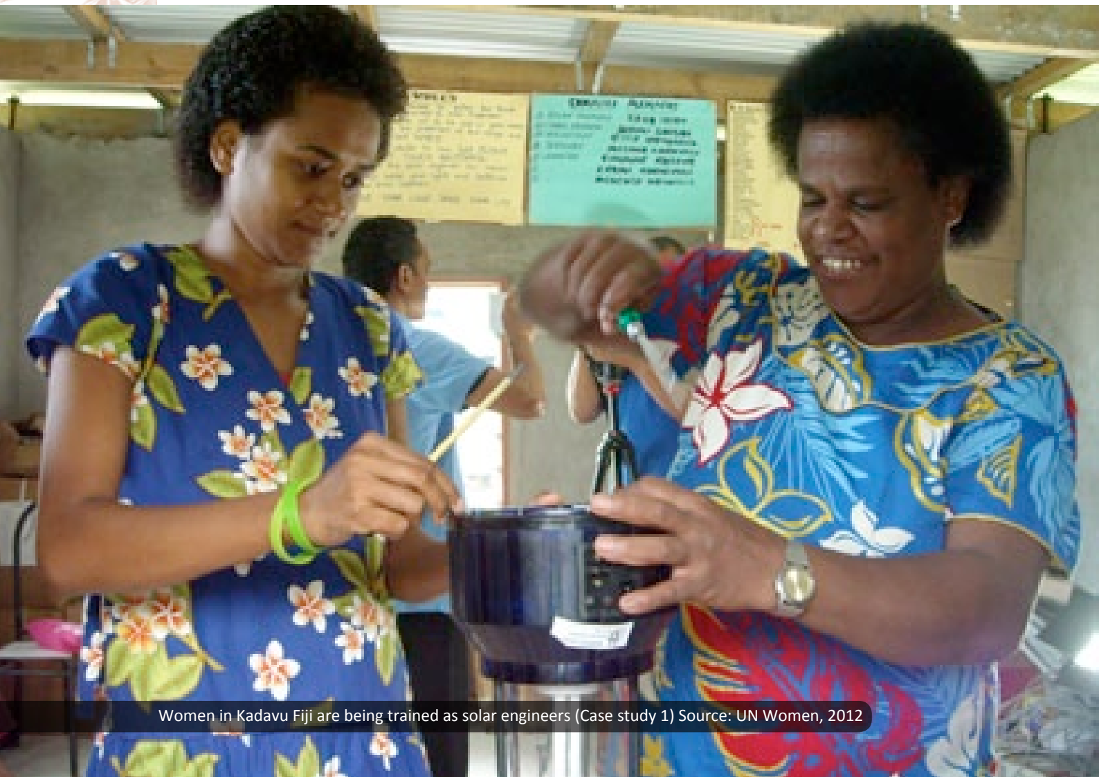
Women in Kadavu Fiji are being trained as solar engineers (Case study 1)