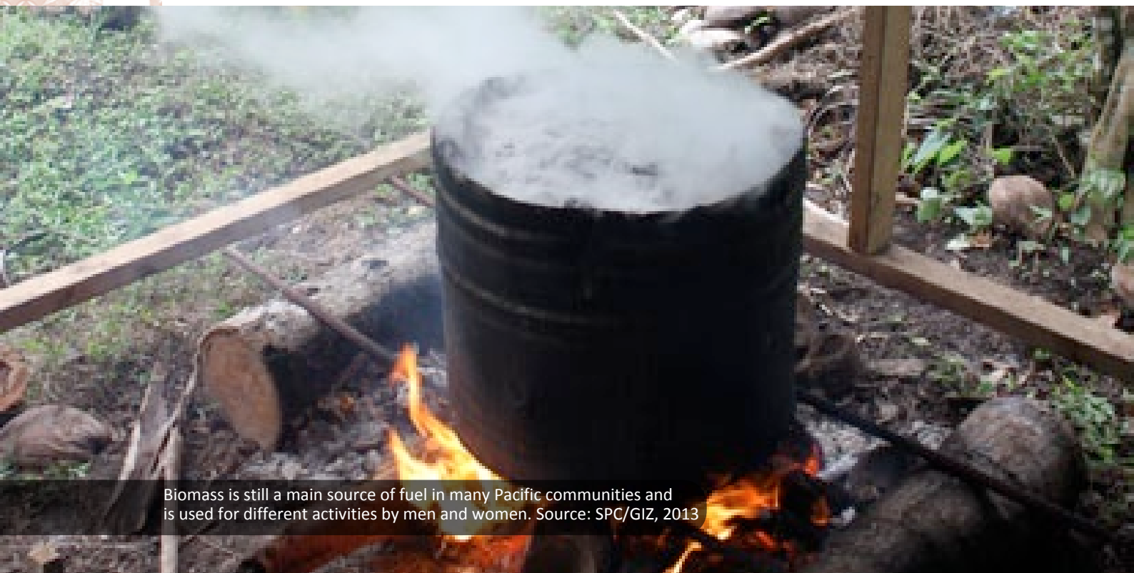
Biomass is still a main source of fuel in many Pacific communities and is used for different activities by men and women.

IUCN / SPC Vanuatu Renewable Energy Project (2011 – 2013, pilot still in progress)