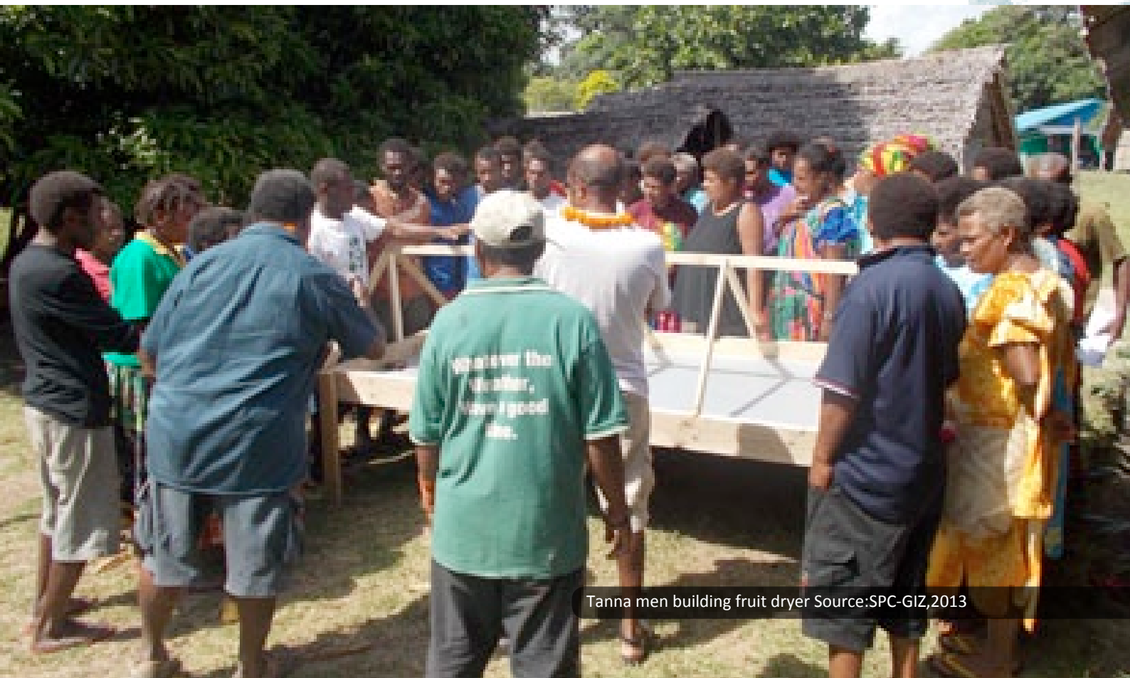
Tanna men building fruit dryer

An example of how gender can affect vulnerability to climate change is where a woman cannot attend training about climate change impacts because she is expected to cater for the training with other women). This limits the information she can access to help her make decisions on how best to manage climate change impacts. Another example is the expectation within a society that a man's role is to provide for his family. If an event causes major losses in the main cash crop that men produce to make money for their families, they may feel significant stress, burden and social pressure to find another way to make money. In both cases, these roles (preparing meals, and generating family income) are not 'natural'; they are based on the society's expectations of what men and women can and should do.